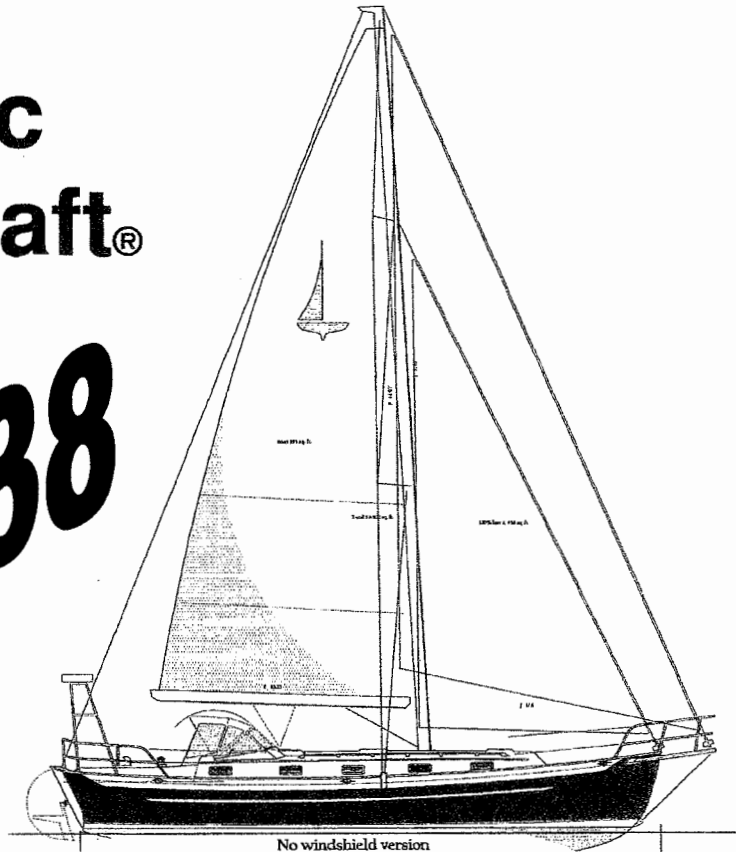
No windshield version