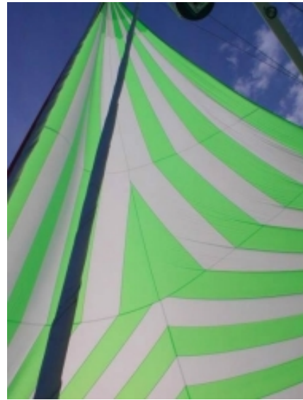
Furling Code-Zero on Sprit